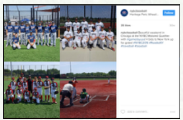
35 likes, no comments