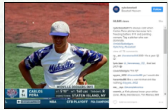
2,700 likes, 78 comments, 67K video views